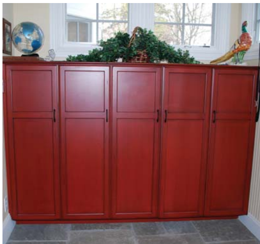
Each child has a cubby in the Oriental red front-entry cubby.