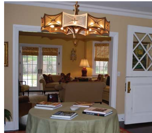
The large chandelier, brought from their previous house, provides welcoming light

May 15, 2009 The Rye High School Parents' Organization presents