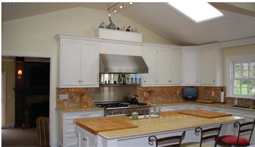
The kitchen is designed for family living and entertaining

"We didn't add a square foot. The project was a good lesson for me because so many clients are scaling back and we've learned to